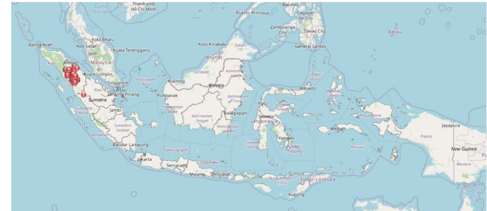
ASF Confirmed Cases (iSIKHNAS)