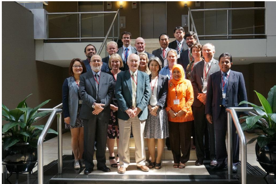
RAWS CG Meeting 8, Canberra, 11 November 2014