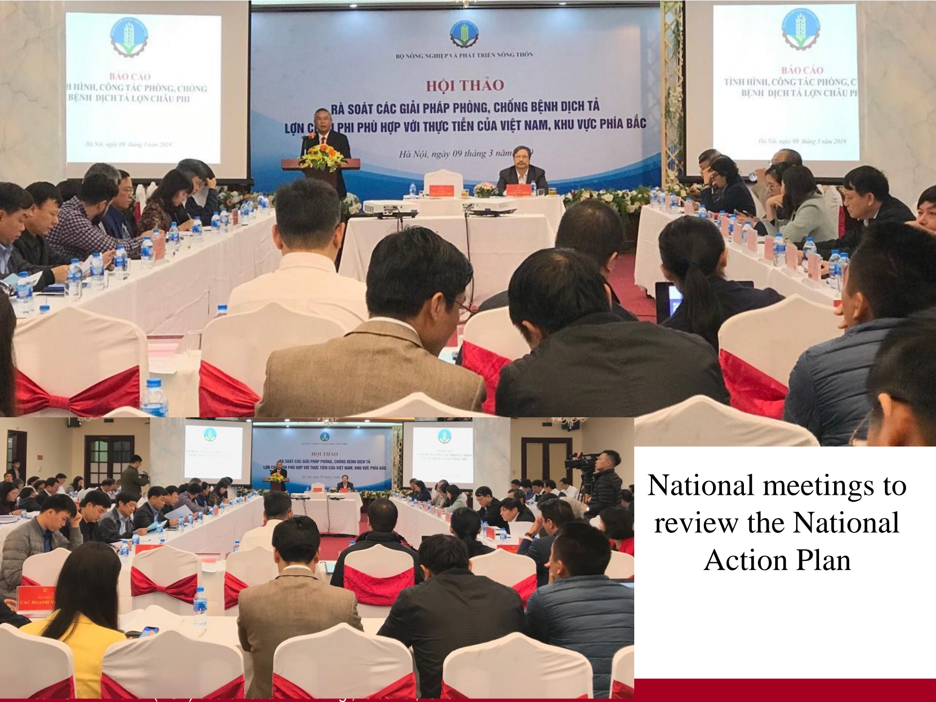
National meetings to review the National Action Plan