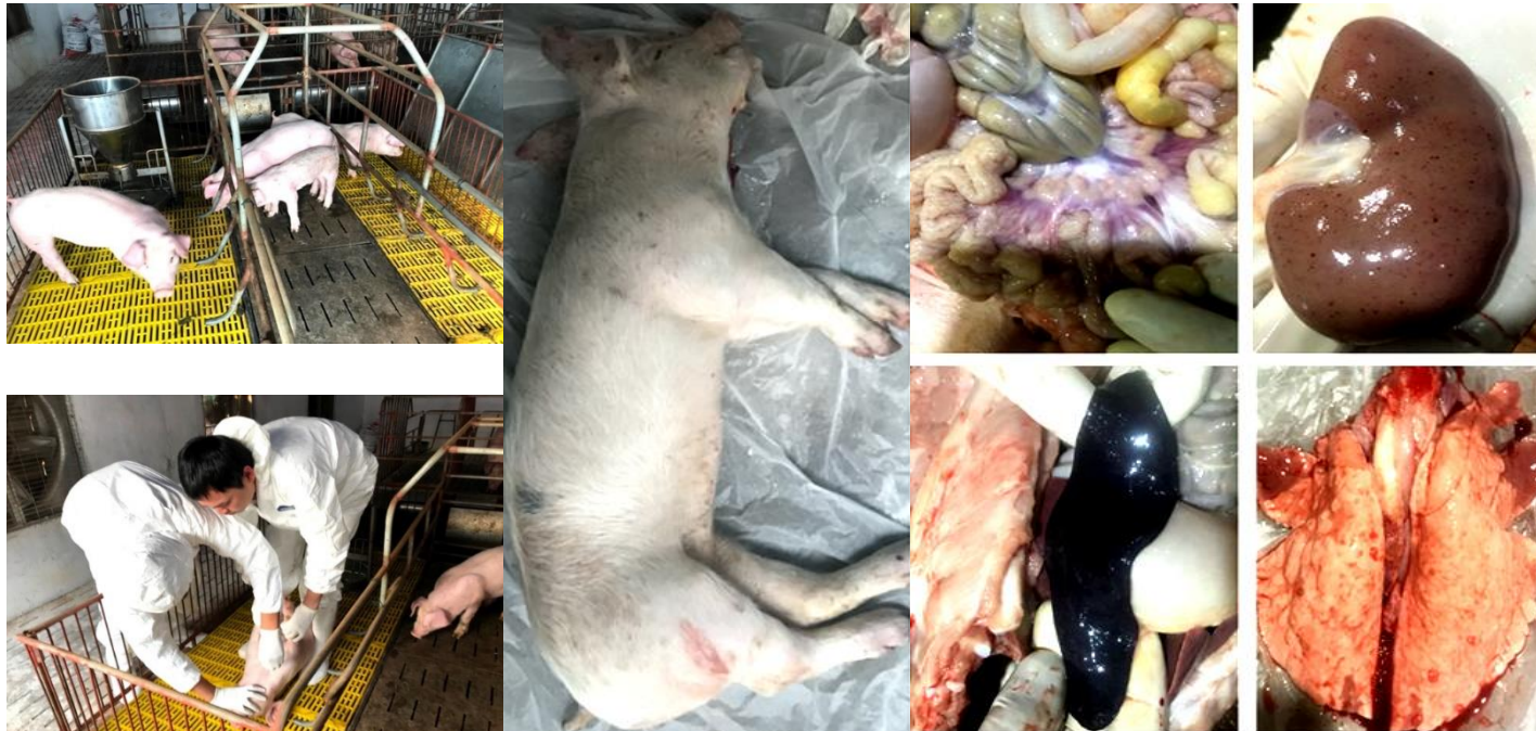
NECROPSY LESIONS OF THE FIRST ASF OUTBREAK IN VIETNAM

On 01 Feb 2019, a pig raising household in Hung Yen province reported sick pigs with high fever and death pigs, DAH staff visited immediately and took samples that were then tested at four laboratories using different testing protocols (OIE, USDA, AAHL) with various primer sets and probes. Conclusion of ASF positive.